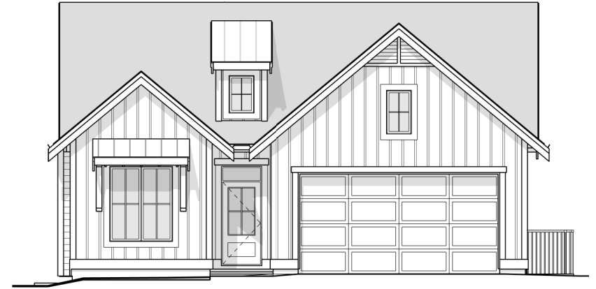
FRONT ELEVATION - A1