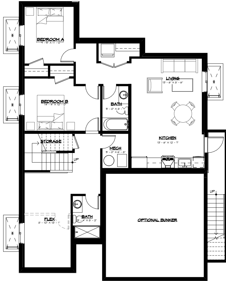
BASEMENT PLAN - A1