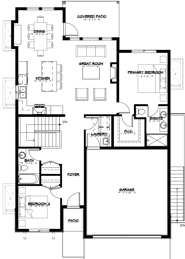
MAIN FLOOR PLAN - A1