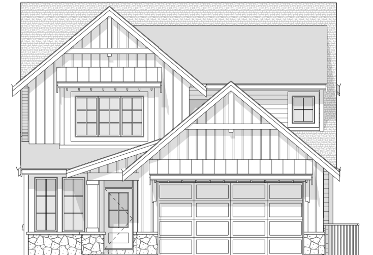
FRONT ELEVATION - C2