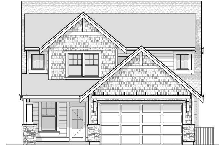
FRONT ELEVATION - C1