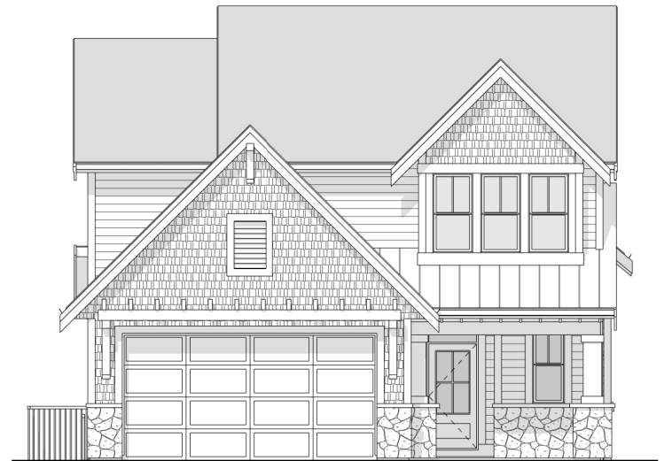
FRONT ELEVATION - E2