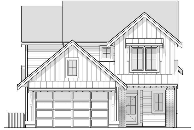
FRONT ELEVATION - E1