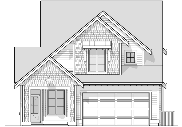
FRONT ELEVATION - B1