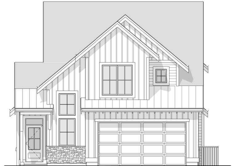
FRONT ELEVATION - B2