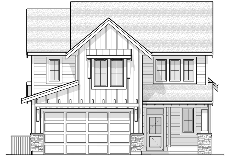
FRONT ELEVATION - D1