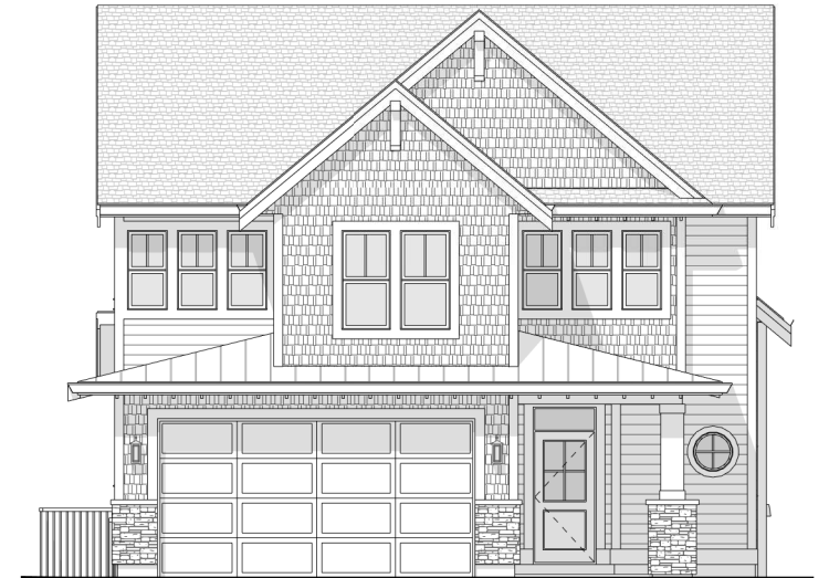
FRONT ELEVATION - D2